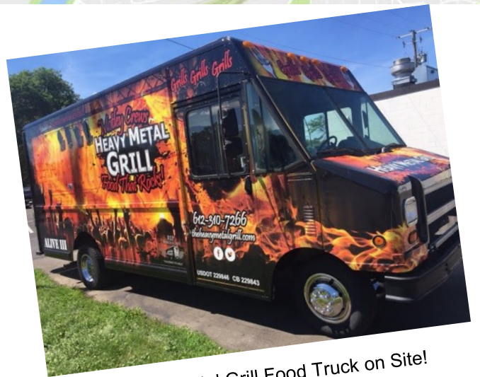
Heavy Metal Grill Food Truck on Site! Come Hungry!